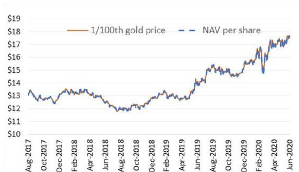
NAV per Share (1) vs. 1/100 th gold price from August 30, 2017 to June 30, 2020

Investing in the Shares does not insulate the investor from certain risks, including price volatility. The following graph illustrates the movement in the net asset value (“NAV”) of the Shares against the corresponding gold price (per 1/100 of an oz. of gold) since inception: